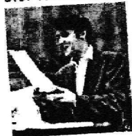
On July 6, 1954 Elvis Presley's first single - "That's All Right Mama," was released by Sun Records

Arthur Crudup was an idol for the young Elvis, and wrote several of Presley's hits, including "That's All Right Mama," which the young Elvis heard Arthur play on Beale Street in Memphis's Handy Park. Two of Crudup's other compositions, "I'm So Glad You're Mine" and "My Baby Left Me" were also recorded by Elvis Presley, but it is not likely that Crudup benefited much from any of this. A second career bloomed for Big Boy with the interest in blues among white audiences in the mid-60s. This prompted appearances at campuses and clubs in the USA and Crudup even journeyed to Europe - always encouraged to perform in a country style. It appears likely that, with his superior lyric and wide cross-racial popularity, Arthur "Big Boy" Crudup gave lots more to the blues than he ever received in return.