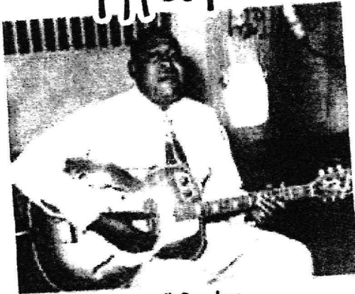
Arthur "Big Boy" Crudup

Born August 24, 1905, Forest, Mississippi and died March 28, 1974 at age 69